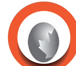
Canadian Hatching Egg Producers

Canadian Hatching Egg Producers (CHEP) ensures that broiler hatching egg farms are producing enough eggs through a supply management system that uses quota, import and price controls to help maintain a stable supply of eggs for Canadian chicken producers.