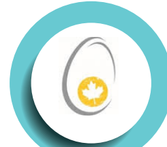
Egg Farmers of Canada

Egg Farmers of Canada (EFC) runs a supply management system. It ensures that operations from policy development to governance are all approached with the utmost regard for: communities, environment and society; the well-being of our animals; and the health, safety and satisfaction of Canadians.